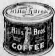
In the original Vacuum Pack which keeps the coffee fresh.