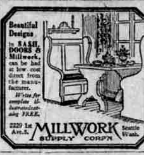
Beautiful Designs in SASSI, DOORS & MILLWORK can be had at low cost direct from the manufacturer.