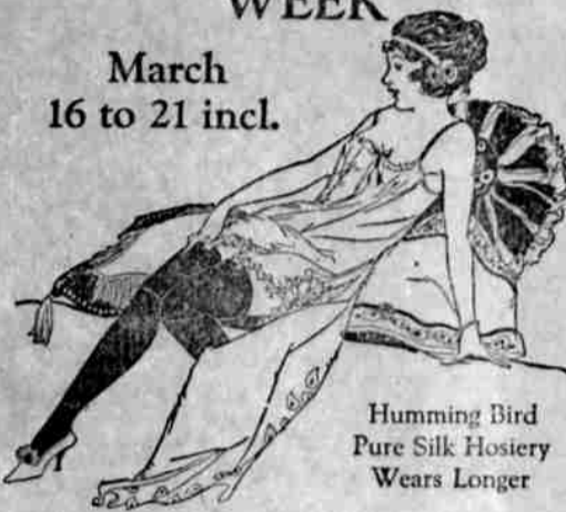
Humming Bird Pure Silk Hosiery Wears Longer