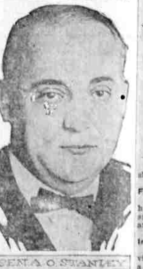
United States Senator O. Stanley, of Kentucky, was severely injured in Washington when struck by a speeding automobile, which failed to stop after knocking him down. He was sent to a hospital.

Have you something to sell, to trade, to give away. Use News-Review columns. Senator Hurt