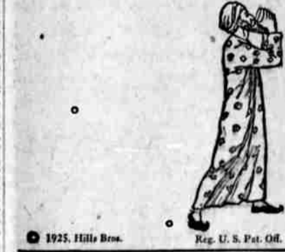
© 1925, Hills Bros. Reg. U. S. Pat. Off.