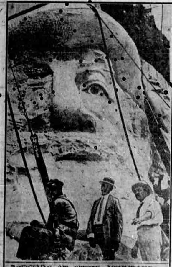
Gutzon Borglum, famous sculptor of the Confederate Memorial on the face of Stone Mountain, near Atlanta, Ga., was summarily dismissed by the committee in charge of the construction of the statue. It is charged that Borglum then destroyed the precious models and plans of the memorial and suit for $50,000 was begun against him for alleged vandalism.