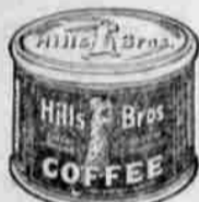
In the original Vacuum Pack which keeps the coffee fresh.