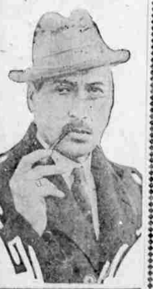
COUNT M. KAROLYI. Count Michael Karolyi, former President of the Hungarian Republic, whose vast estates were recently confiscated by the Hungarian courts on the charge of high treason, has reached New York after a flying trip, to be at the bedside of his wife, who is ill with typhoid fever.