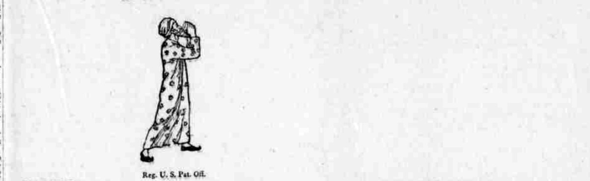
©1925, Hills Bros. Reg. U. S. Pat. Off.

stone, Arizona. The Blackwell, Okla., Chamber of Commerce has decided to add an Industrial Secretary to its office and recently raised an additional budget of $10,000 for the year 1925 to take care of this additional work.