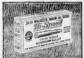
Remington Hi-Speed Cartridges in .25, .30, .32, .35, .38 and .44 Calibres for nearly every standard rifle. Distinguished for flat trajectory accuracy and killing power.