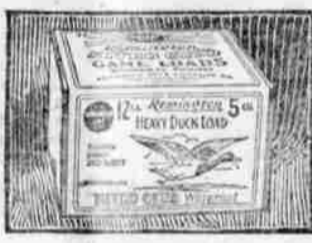
Remington Game Loads. Specifically loaded to a uniform standard of velocity, pattern and penetration, all with moderate recoil.