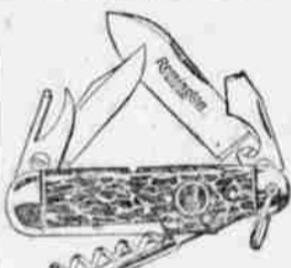
No. R-4247 The Remington Knife Compound Tool. A big husky knife with two cutting blades, punch blade and can opener.