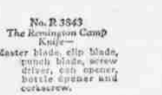
No. R-3543 The Remington Camp Knife. Master blade, clip blade, punch blade, screw driver, can opener, bottle opener and corkscrew.