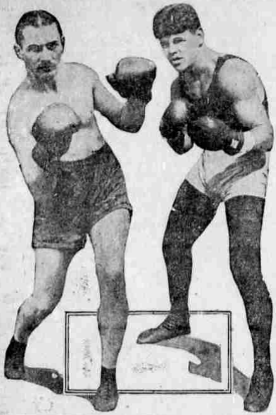
BENNY LEONARD & MICKEY WALKER

Mickey Walker, world's champion welterweight, will defend his title against Benny Leonard, world's champion lightweight, in a 12 round, no-decision fight in Boyle's Thirty Acres, Jersey City, N. J., on Friday, August 8.