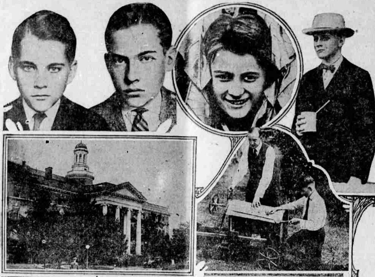
Above: CALVIN & JOHN COOLIDGE, (Circled) IN HAPPIER DAYS (Right) HIS LAST PHOTOGRAPH. Below: WALTER REED HOSPITAL & PRESIDENT & CALVIN COOLIDGE, JR.

A nation stands in silent grief with President and Mrs. Calvin Coolidge at the bier of their youngest son, Calvin, Jr., whose gallant battle against deadly blood poisoning aroused the admiration of those who love a fighter. The manly little fellow died in Walter Reed Army Hospital in Washington of poisoning which followed infection from a blister he suffered while playing tennis with his brother, John, on the White House courts. He was a great "pal" of his father, who is shown, helping him build a wagon just before Mr. Coolidge became President. The first Summer vacation after his father became ruler of the country Calvin spent on a tobacco farm in Connecticut, earning pocket money. In his last photograph he is pictured in a "seventh inning stretch" in the Washington ball park, only three days before he was stricken with the fatal illness.