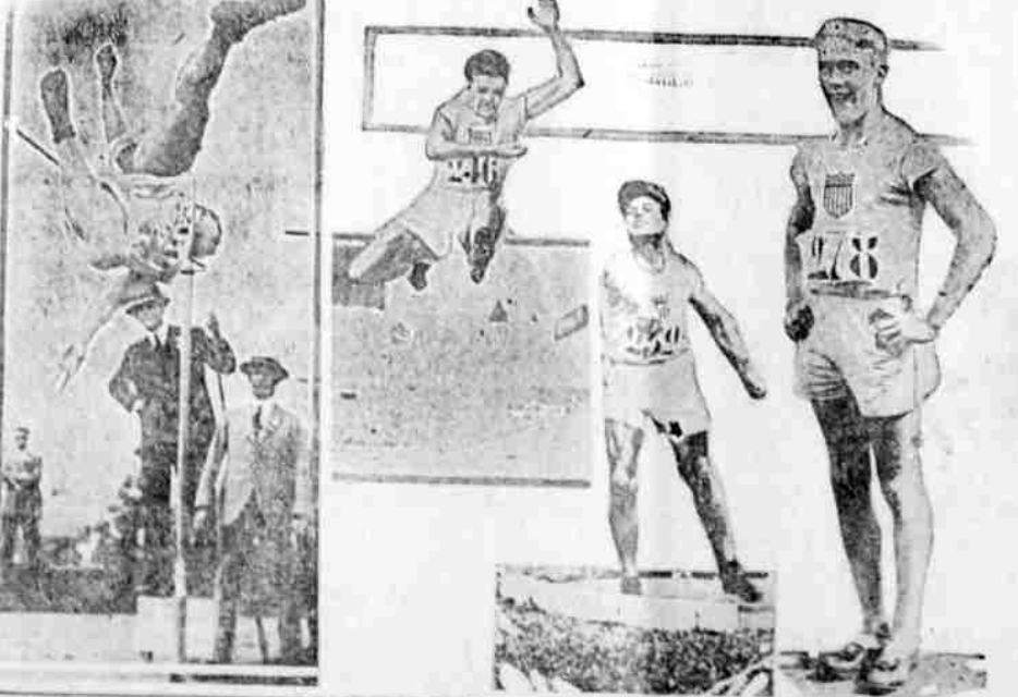
H. OSBORNE, BOB LE GENDRE, BUD HOUSER & F. M. TAYLOR.

These are the first pictures to reach the United States of the victorious American athletes in the Olympic games in Paris. Bud Houser, of California, is shown winning the weight throwing contest with a heave of 11,995 metres. H. Osborne is shown in his thrilling high jump, which he won with a new Olympic record of 6 feet 6 inches. Bob Le Gendre made a world's record of 425 feet 5 1/2 inches in the broad jump.