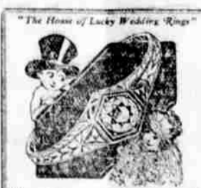
"The House of Lucky Wedding Rings"

Under Mr. Hogan's bill all eggs for export must be collected in premises registered by the ministry of agriculture, tested and graded under official supervision and packed in standard boxes. It is hoped by abolishing defective packing and grading to double the Irish egg export.