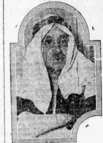
"PUSSYFOOT" JOHNSON in Moslem Costume. Photo taken in Egypt where he traveled as prohibition lecturer.

William E. Johnson, better known as "Pussyfoot" world-wide traveler, lecturer and author, who has demonstrated that a man can be a prohibitionist and a "dog-gone" good fellow at one and the same time, is to deliver an address at the Armory on Friday evening, June 6.