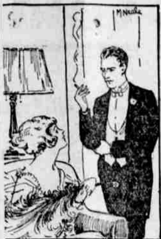
"You are a daring hostess," he told her.

run into the dining-room, wasn't you?" But arriving guests out his sentence short. Suzanne felt uneasy. Of course the place cards would be all right—yet what if they weren't? She tried to slip away to the dining-room a few moments later, but there was no opportunity. And when at last dinner was announced she was so worried that she felt sure the butler had made a mistake and put the wrong people next each other. She glanced down the table; everything seemed to be all right. Again—and her heart sank. For Hiram J. Caldwell and Senator Graham had been so placed that