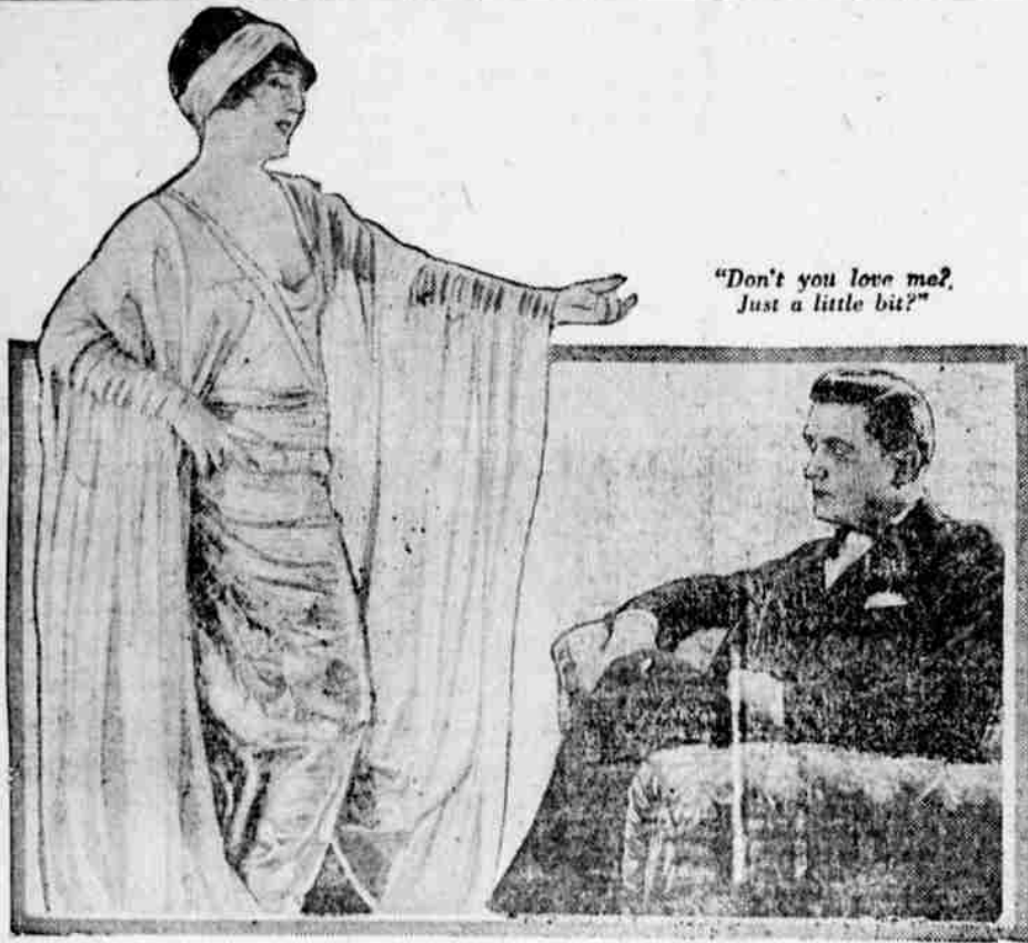
"Don't you love me? Just a little bit?"