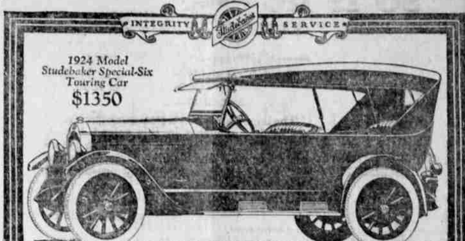
1924 Model Studebaker Special-Six Touring Car $1350

It is logical that we should ask the prospective buyer to gauge the worth of the Studebaker Special-Six by the measure of its sales success.