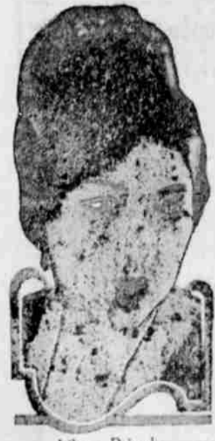
Aileen Pringle , the talented actress who forsook London society for a career, is to be seen next in an important role in Goldwyn's romantic picture, "In the Palace of the King". She has also appeared in "Souls For Sale" and "The Strangers' Banquet."