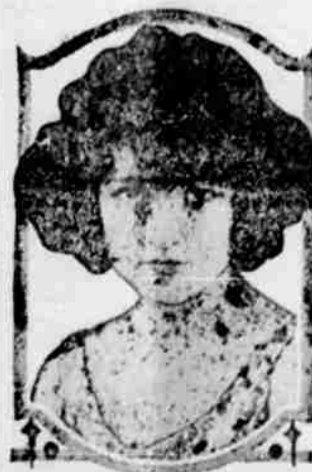
Eleanor Boardman , called "The Cinderella of the Screen", whose next work will be as the feminine lead in "The Day of Faith", Goldwyn's picturization of Arthur Somers Roche's novel. Miss Boardman played the feminine lead in "Three Wise Fools" following her work as the heroine in "Souls For Sale."