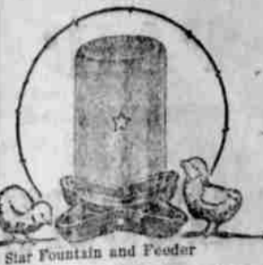
Star Fountain and Feeder

This excellent Feeder and Fountain is made of single piece of heavy metal, and protects the feed as well as preventing the chicks from drowning. Fits any Mason jar.