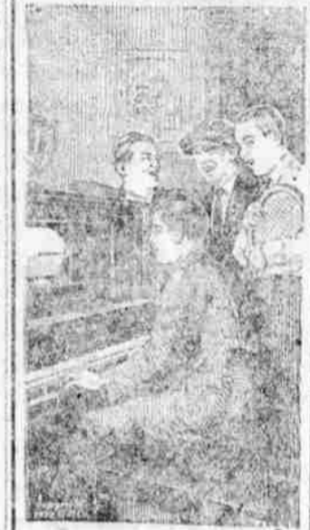
Scene From David Belasco's "The Gett Diggers," at the Antlers Thursday, December 7.