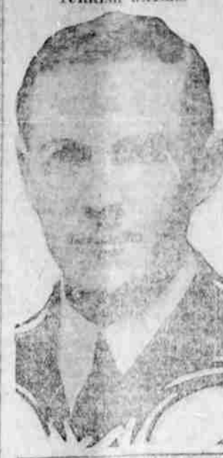
Vice-Admiral Sir O. de B. Brock, commands the immense British fleet in Turkish waters.