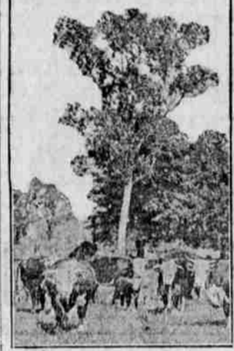
A High-Class Beef Breeding Herd.

Improve Each Generation. In profitable beef production a herd of good cows and a good purebred bull are of great importance. Each