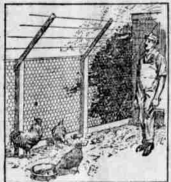
Wires Stretched as Shown Here Will Effectively Prevent Chickens From Wandering Into the Neighbors' Yard.

Chickens can be kept in their pen by nailing two-foot slats at an angle to the posts and strung a number of strands of thin wire through them as shown in the drawing. The chickens do not see these wires and when