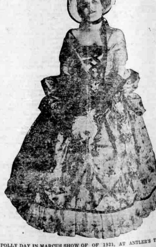
POLLY DAY IN MARCUS SHOW OF OF 1921, AT ANTLER'S THEATER, SATURDAY, NOVEMBER 12.