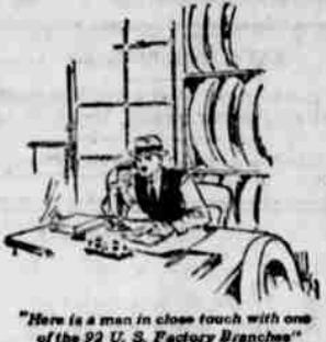
Here is a man in close touch with one of the 92 U. S. Factory Branches

of people. The substantial citizen. The man who knows that you can't get something for nothing. The steady customer—not the bargain hunter.