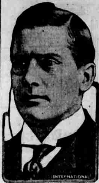
Austen Chamberlain has retired from the position of chancellor of the exchequer in the British admiralty.