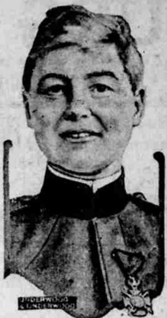
Lieut. Flora Sandes, who fought through the war with the Siberian army and was wounded and decorated, came here from a speaking tour in Australia on her way to Siberia.