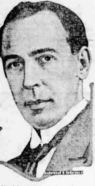
Sir John Anderson, the undersecretary for Ireland, who has been aiding in trying to solve the Irish question.

entrance approach, long hall and library of a palatial Eoghanian mansion comprise an unusual building that was built on the big stages at the Metro studios Hollywood for "The Price of Redemption." Bert Lytell's new star-vehicle which will be shown at Liberty theatre tonight for the first time in Roseburg. It is seldom such a set of this size, 110 feet long and 25 feet high, completely constructed on one floor.