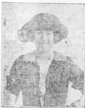
Edna Wallace Hopper.

Photo, pits her wits and charms against the village boss and succeeds in a kind of regeneration of the entire town. Headline in East of "Just Around the Corner," is Edna Wallace Hopper.