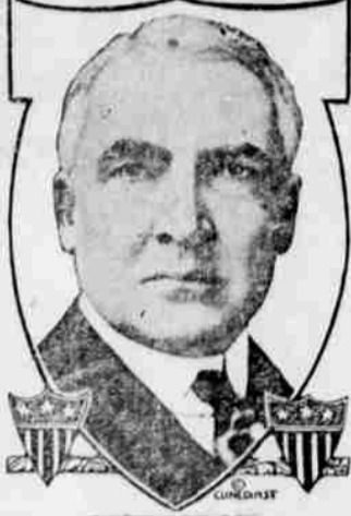
WARREN G. HARDING