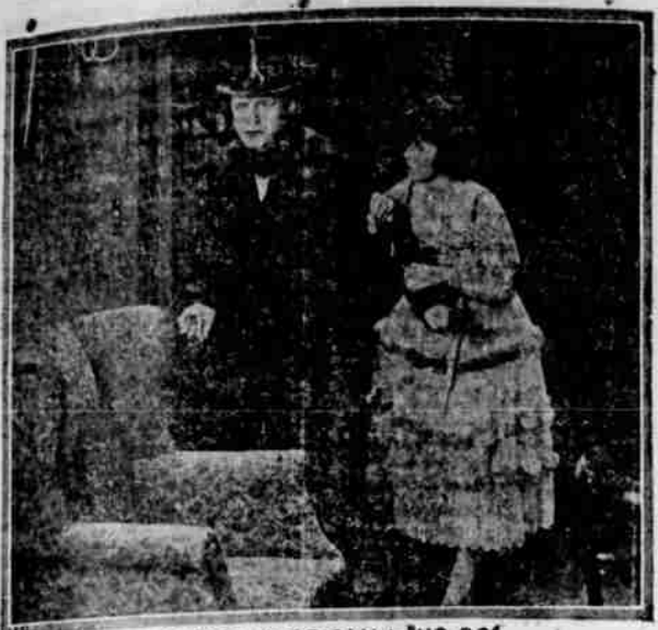
J. WARREN KERRIGAN in "NO. 99" W. W. HODKINSON DISTRIBUTION

Scene from "No. 99" coming to the Liberty on Wednesday and Thursday, matinee and evening.