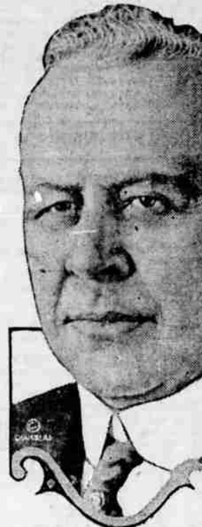
Fred B. Lynch of St. Paul is national Democratic committeeman for Minnesota.