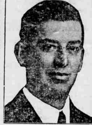
James V. McClintic represents the Seventh district of Oklahoma in congress. His home is in Snyder.