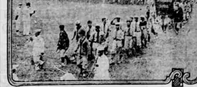
Here's indisputable evidence that the Filipino people have been Americanized! The great American game of baseball is the rage in the islands. This photograph shows a parade which preceded one of the big games in Manila. Baseball is played from one end of the archipelago to the other, and, as in other branches of athletic sports, some classy players have been developed.

At a recent Washington gathering she gave in perfect English a concise account of the work of a woman's club in Manila which supplies milk to the babies of the poor and trains mothers to care for their young children. She told of another woman's club which has branches all over the Philippine Islands and which maintains day nurseries for the children of the working women, provides Christmas cheer for the lepers, the insane and the convicts, and gathers data to influence legislation for the benefit of Filipino women and children.