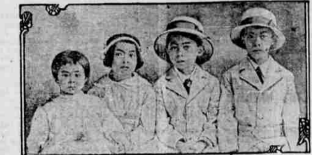
THE CHILDREN OF THE PHILIPPINE COMMISSIONER. The Baby of This Group Speaks Three Languages—Visayan, Spanish and English.