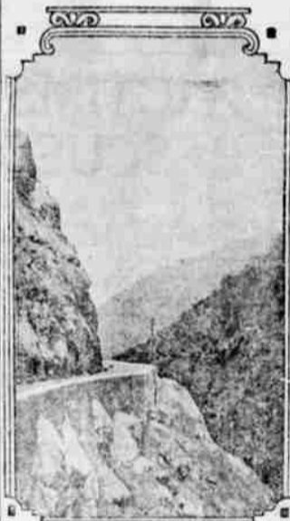
"At times we seemed perilously near the jumping off place."

The Philippines are rich in hydro-electric possibilities. This power is the cheapest power on earth. And it is everlasting. Your travelogue is neither a prophet nor the son of a prophet, but he predicts that one day there will be innumerable Philippine government owned hydro-electric plants in the canyon we are now passing through. Think of the possibilities of such a project! Today the trip from Manila to Baguio is too expensive for the average Manila worker and his family, many of whom may live and die without beholding the wondrous beauties of their own island of Luzon. Think of what a blessing it would be to Filipino mothers and children to feel upon their fevered brows the cool, invigorating breezes of the mountain tops, now so near and yet so far! With the Philippine government owning its own electric railways and hydro-electric plants it would be possible to bring