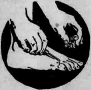
Corns and "Geta-It" Can't Live Together

The hurting "pap" goes right out of that corn the moment a few drops of "Geta-It" lands thereon. It is thorough, and "for keeps."