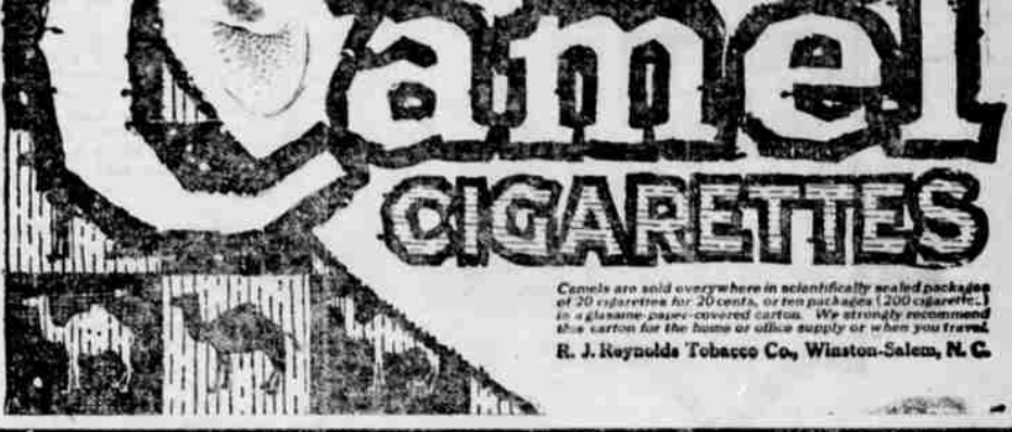
Camels are sold everywhere in scientifically sealed packages of 20 cigarettes for 20 cents, or ten packages (200 cigarettes) in a glassine paper-covered carton. We strongly recommend this carton for the home or office supply or when you travel. R. J. Reynolds Tobacco Co., Winston-Salem, N. C.

If you want to get some personal information about Camels compare them with any cigarette in the world at any price!