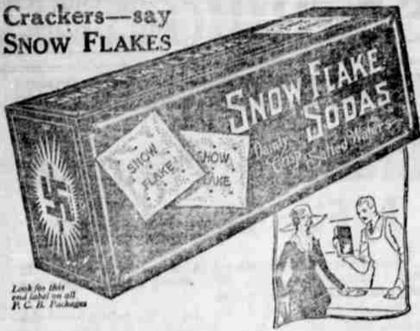
Look for this end label on all R. C. B. Packages