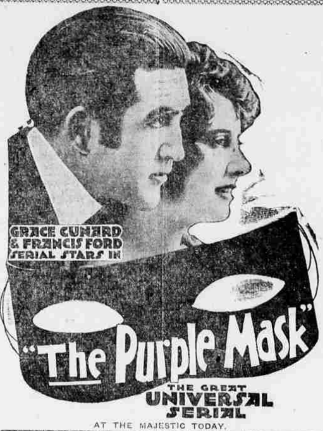
GRACE CONRAD & FRANCIS FORD SERIAL STARS IN 'The Purple Mask' THE GREAT UNIVERSAL SERIAL AT THE MAJESTIC TODAY.

A cough that racks and weakens is dangerous, it undermines your health and thrives on neglect. Relieve it at once with Dr. King's New Discovery. This soothing balsam promptly breaks the throat, loosens the phlegm, its antiseptic properties kill the germ and the cold is quickly broken up. Children and grown-ups alike find Dr. King's New Discovery pleasant to take as well as effective. Have a bottle handy in your medicine chest for grippe, croup and all bronchial affections. At your druggists, 50c.