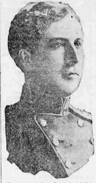
ALBERT, KING OF THE BELGIANS.

Belgium is essentially a manufacturing country, and it is largely dependent upon foreign supplies for its food.