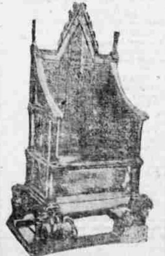
CORONATION CHAIR, IN WHICH BRITISH MONARCHS HAVE BEEN CROWNED FOR GENERATIONS.

After communion the king descends from his throne and, wearing the crown and carrying the scepter and rod, goes into St. Edward's chapel, followed by a great procession of bishops, peers