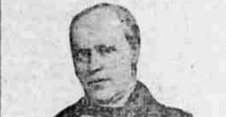
THE REV. RANDALL T. DAVIDSON, ARCHBISHOP OF CANTERBURY, WHO WILL CROWN THE KING AND QUEEN.

to the king, first saying these words: "Our gracious King, we present you with this book, the most valuable thing that this world affords. Here is wisdom; this is the royal law; these are the lively oracles of God." The Bible then is replaced upon the altar.