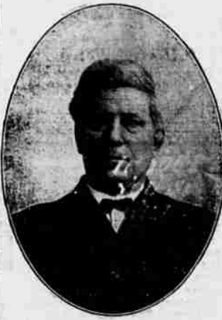
THE COWBOY PREACHER.