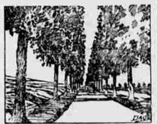
FINELY SHADED FRENCH ROAD.

It is proposed to plant trees along the roadsides of New York state in order to keep the moisture in the road and prevent raveling, and the question has been raised whether or not the roots of such trees may spread out underneath the road surface and eventually create great damage in a severe climate where there are extremes of heat and cold. While French roads are not always bordered with shade trees, they are so very frequently, and my information is that the trees are planted not only for furnishing shade, but in order to protect the roads themselves against the effects of excessive heat and drought. It is believed that the long, dry summer season is much more inimical to roads than severe cold. The chief officer in charge of the public roads in Marseilles is of the