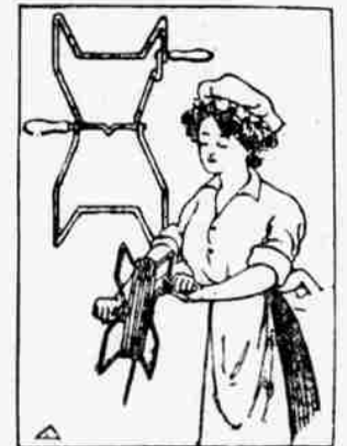
WINDS ROPE NEATLY.

A West Virginia man has devised a reel, herewith shown, on which the clothesline can be gathered quickly and neatly, and she who presides over the family wash will no longer have to loop the rope over thumb and elbow. The reel is in the form of a huge spool or iron framework, with a handle in