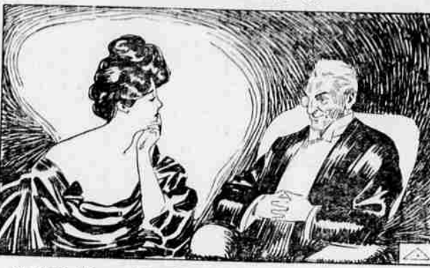
The Maid: "Do you believe it's unlucky to get married on a Friday?" The Abominable Bachelor: "Certainly. Why should Friday be an exception?"