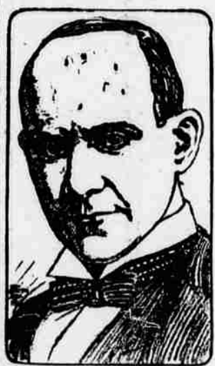
EUGENE VICTOR DEBS.

The Socialist Candidate. For the third time Eugene V. Debs, candidate of the Socialist party for president of the United States, is making the race for the highest honor in the gift of the people. In 1900 he ran on the Social Democratic ticket, receiving 87,814 votes. Four years later as a straight Socialist 402,283 ballots were cast in his favor. Mr. Debs' halls from Terre Haute, Ind., where he was born fifty-three years ago. In his younger days he was a locomotive fireman and from 1883 to 1886 was secretary-treasurer of the brotherhood of that craft. Resigning from that body, he organized the