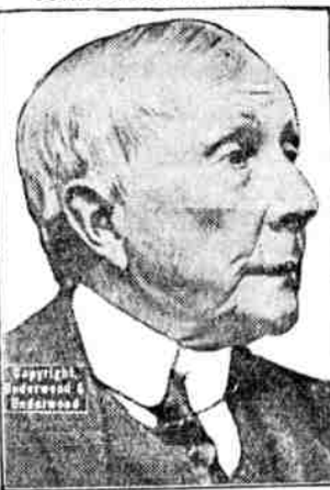
John D. Rockefeller recently celebrated his eightieth birthday.

today received a letter stating: "Hereafter we shall correct our copy to read that cars are permitted to go through at all hours but that the road is in bad condition in spots." We are pleased to have this correction made although it took considerable correspondence to place the actual conditions of this road before the association." This means that for the balance of the tourist season Roseburg will get her full share of the travel and it will not be through Eastern Oregon. This is just one of the activities of the Chamber of Commerce which will continue to keep the highway association informed as to conditions of roads and road work in Douglas County.