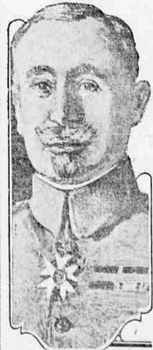
General Robert Nivelle.

General Robert Nivelle's elevation to the post formerly held by General Joffre indicates the strenuous methods of Briand's new ministry to inject new blood into the conductors of the war.