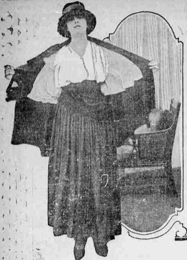
The Brusloff gown.

Paul Poiret, the famous French designer, has used hatter's plush to good advantage in fashioning the Brusloff gown. The skirt of hatter's plush is really one of the most extreme that has come from this fashion creator this season. It exploits the irregular skirt, which, however graceful its lines may be, is not a thing of beauty. The flounce of the skirt is exceedingly full and is fastened over the irregularly draped yoke by means of double stitched cartridge plaits, the line of the hem approximating in its irregularity that of the yoke. The coat of green broadcloth is cut with a fitted skirt and has a fancy fastening at the waist line. The hat of brown velvet has a touch of green in the ribbon banding which encircles the straight crown and also in the tiny row of velvet balls suspended from the rim of the brim. A fancy ruff of the ribbon finishes the hat at the side front.