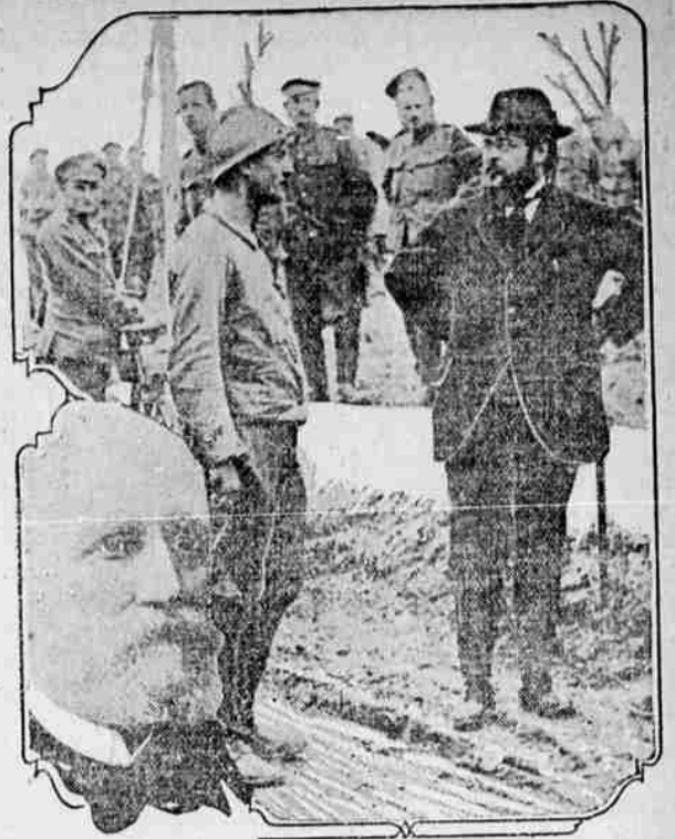
M. Albert Thomas on a visit to the front and (insert) M. Alexander Ribot. After Premier Briand these two men have the most important posts in the new French cabinet. Both are members of the war council of five. As minister of finance Ribot must raise the money to carry on the war. As minister of national manufactures, Thomas is charged with the duty of supplying the French armies with munitions and transports.