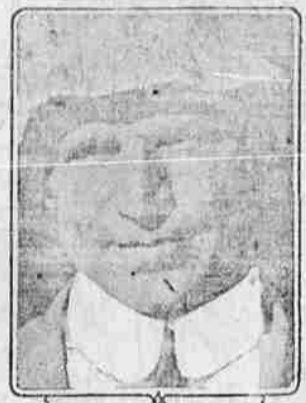
Sir Ernest Shackleton (top) and Capt. F. A. Worsley, photographed on arrival in U. S.

Sir Ernest Shackleton and Capt. F. A. Worsley are now in this country, busily preparing for a fourth rescue trip to save ten members of the ill-fated Shackleton expedition of last year who are supposed to be marooned on an island in the Ross sea. Shackleton says the men have ample provisions to last them a year.