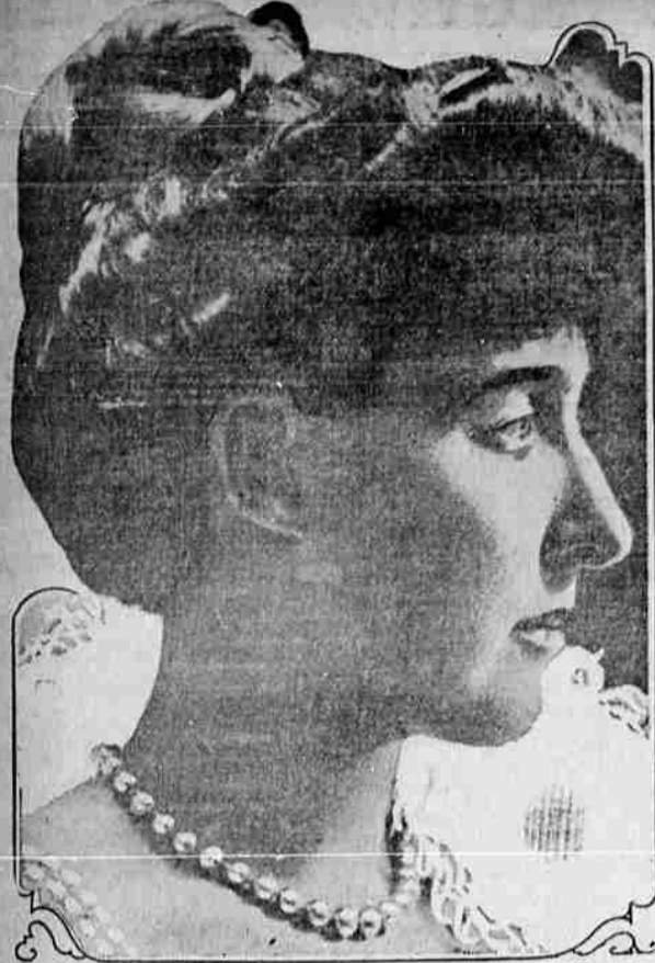
The Duchess of Aosta.

The Duchess of Aosta, French woman who married into the Italian royal family and before the war won a great reputation as a big game hunter in Africa, is at present the Red Cross "czar" of the Italian army. Tall, imperious, and perfectly self-possessed, she goes about from one hospital to another, setting every detail in order, improving, extending, approving, and has now brought Italian Red Cross hospitals to a state of well-nigh perfection.