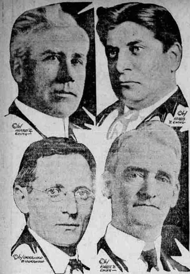
Left to right, top: Charles H. Randall and Thomas D. Schall. Bottom: Meyer London and Whitnell P. Martin.

So nearly even will be the representation of the two big parties in the next lower house of congress that a mere handful of men, who are neither Republicans nor Democrats, will hold the balance of power. These men are: Schall of Minnesota and Martin of Louisiana, Progressives; Fuller of Massachusetts, Independent; Randall of California, Prohibitionist, and London of New York, Socialist.