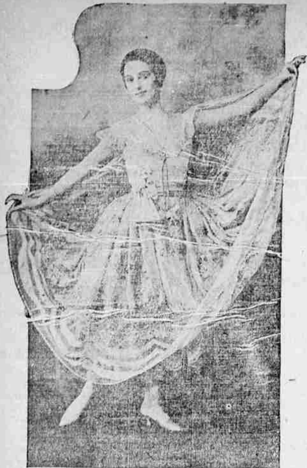
FLORENCE WALTON, A FAMOUS PLAYERS STAR IN PARAMOUNT PICTURES.

This dress is of blue and silver tissue embroidered in silver and rose color. The edge of the skirt is trimmed with hemstitched festoons of shades of mauve and is hemstitched in silver. Petticoat is trimmed in shades of mauve and pink. Bodice of flesh colored satin with bands of mauve and blue.